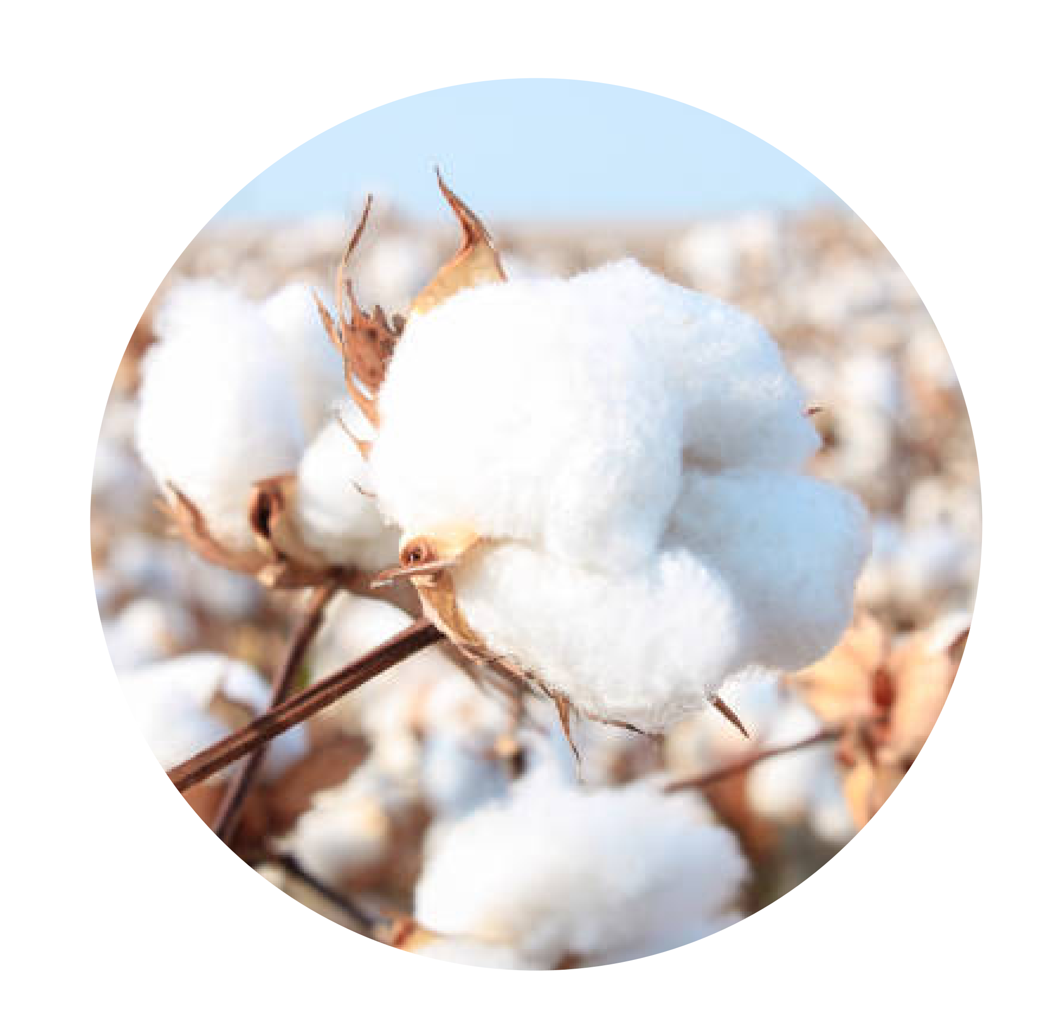
HIGH YELLOWING RESISTANCE